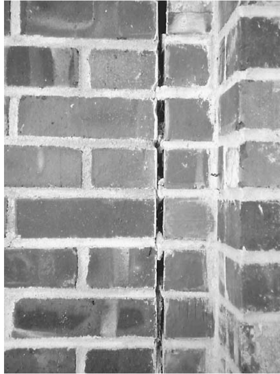
Figure 9-14 Mortar bridges across an expansion joint can cause localized spalling where movement is restricted.

this additional limitation, using the sealant at only 80% of its capacity for this example, the formula is then